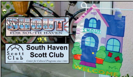
The 29 th Annual South Haven Cottage Walk June 27 | Presented by SHOUT and The Scott Club