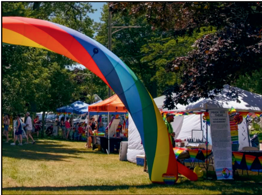
South Haven Pride | June 27-28 Stanley Johnston Park