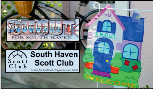
The 29 th Annual South Haven Cottage Walk June 27 | Presented by SHOUT and The Scott Club