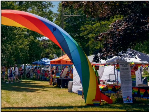
South Haven Pride | June 27-28 Stanley Johnston Park